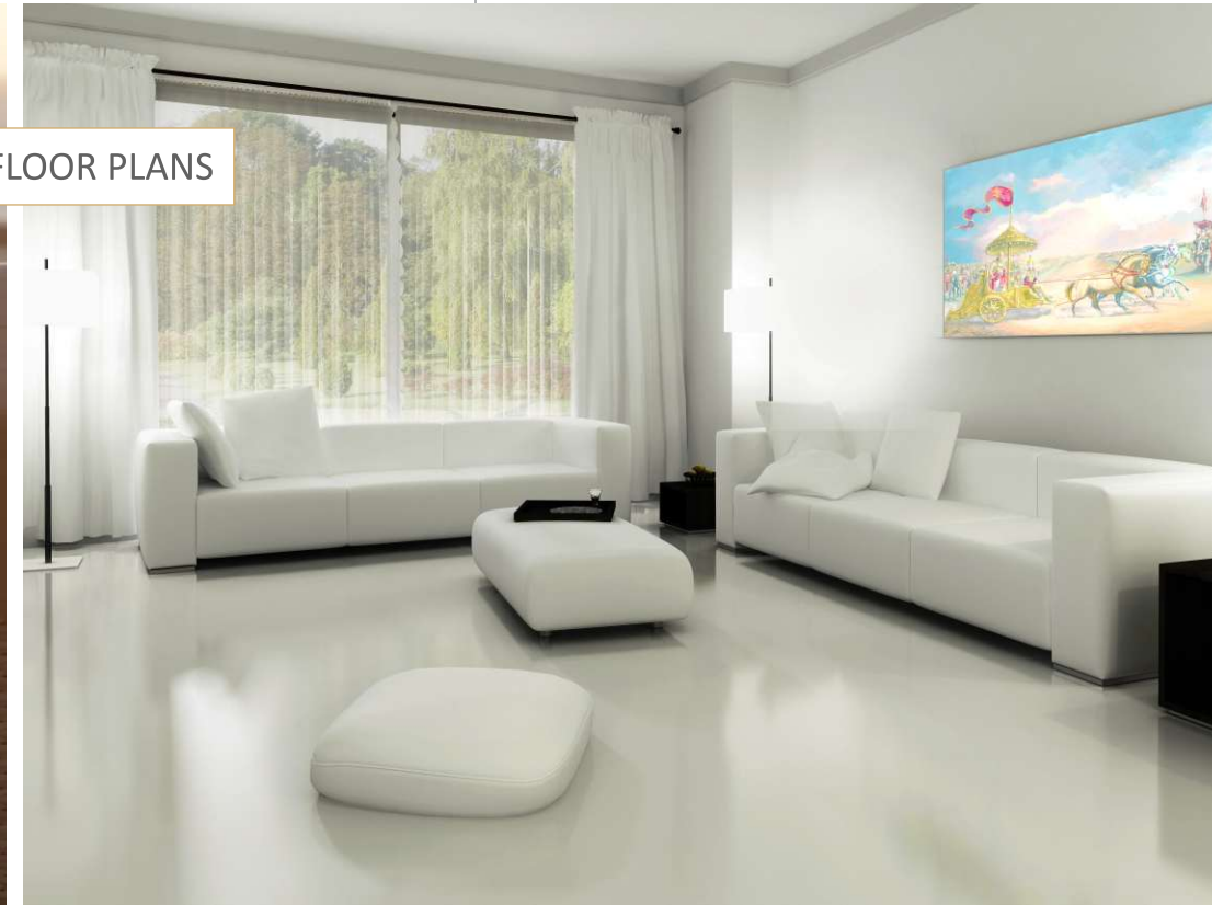
COMFORT IN FLOOR PLANS