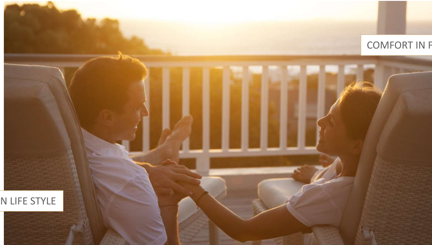
STYLE IN LIFE STYLE