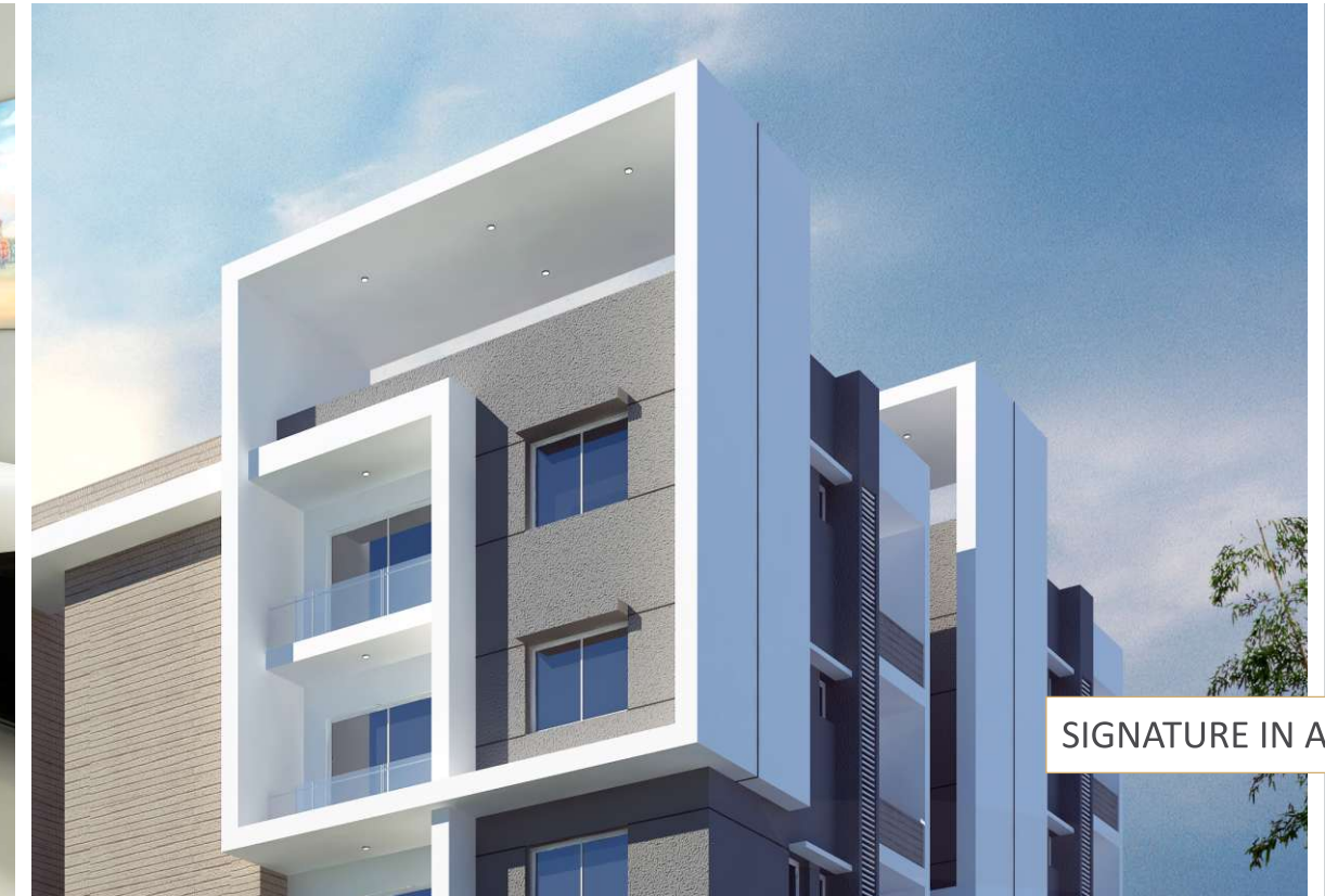
SIGNATURE IN ARCHITECTURE